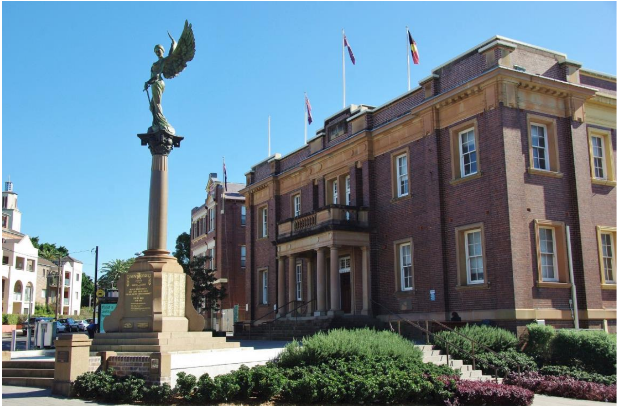
Marrickville Soldiers Memorial